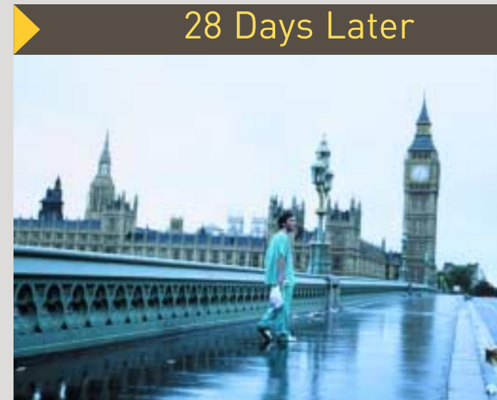
28 Days Later